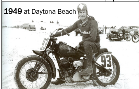
1949 at Daytona Beach